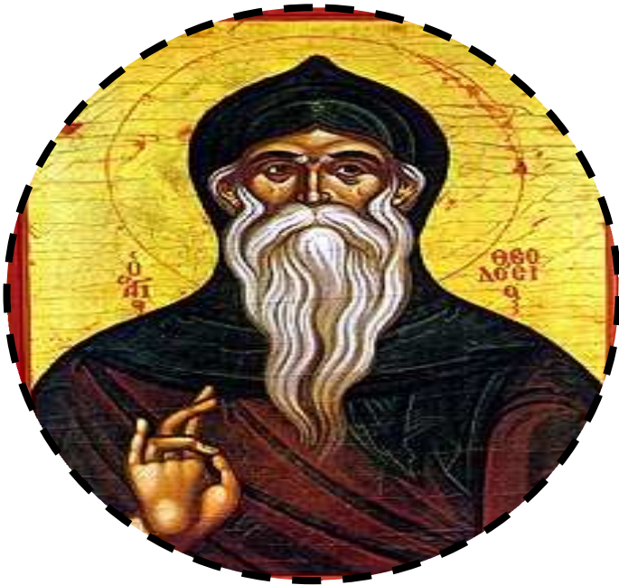
Saint Theodosius the Great, the Cenobiarch